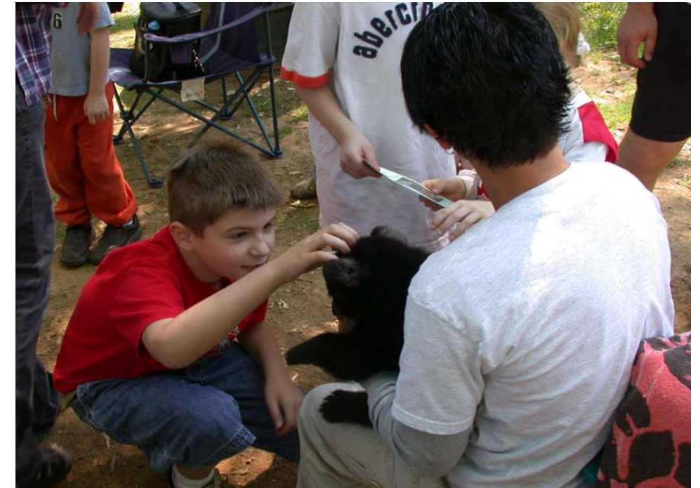
A visitor to Earth Day at The Hays Preserve celebrated pets a baby black bear. Over 500 people attended the Earth Day Celebration on April 21st.