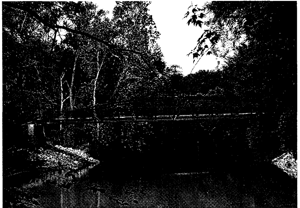
The new greenway bridge over Flint River connects the picnic area of the Hays Preserve to Big Cove Creek and the Flint River Greenway.